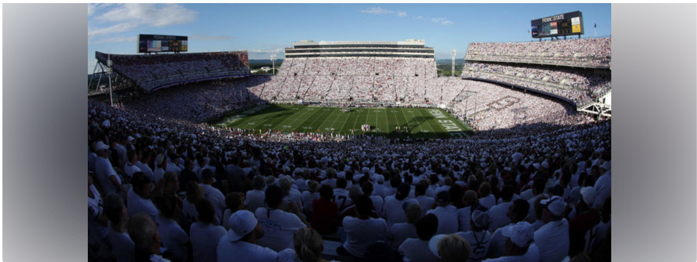
STATE COLLEGE, PA - SEPTEMBER 10: General view of the Alabama Crimson Tide and Penn State Nittany Lions game during the second half at Beaver Stadium on September 10, 2011 in State College, Pennsylvania.

Penn State had its way with Iowa during a primetime showdown on CBS on Saturday night.