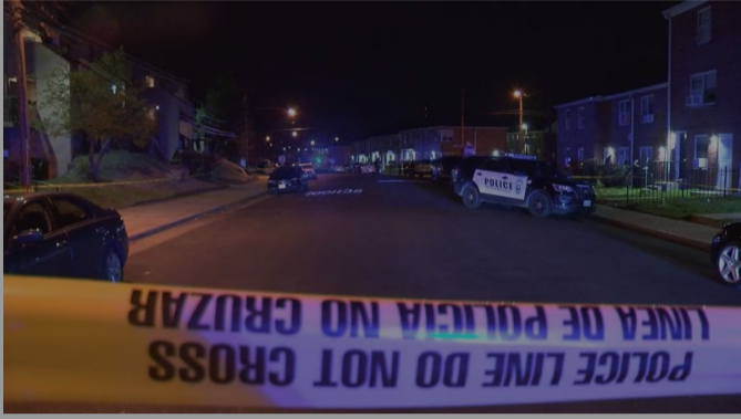
▶ 18-year-old found shot to death in Gilpin Court