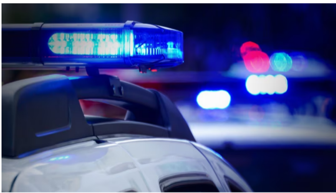
N.C. woman dies in Hanover tractor-trailer crash