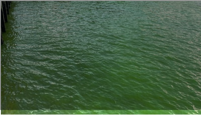
PHOTOS: Residents spot bright green water at Wrightsville Beach