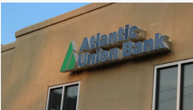
Virginia community banks Atlantic Union and American National announce merger