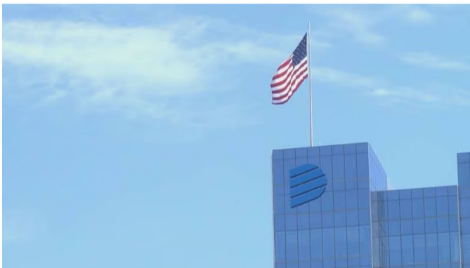
Dominion gets approval to charge customers again for carbon market participation