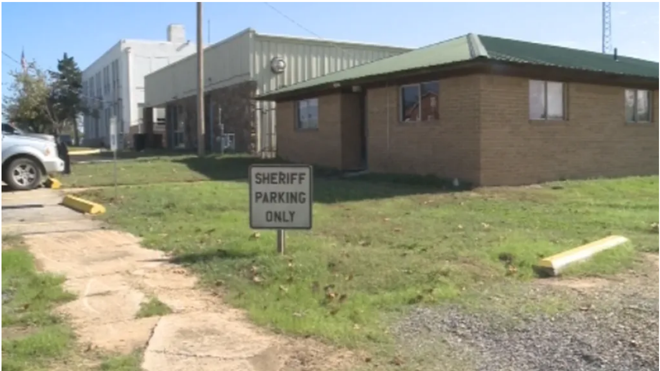
Pushmataha Sheriff's Office