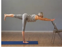
Women Only: Stretch This Muscle to Stop Bladder Leakage (Watch) Patrol Health Zone