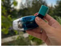
Why People with Breathing Problems Are Ditching Their Inhalers for This ProductHuntor