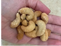
Fighting Diabetes? This Discovery Leaves Doctors Speechless! Healthier Living