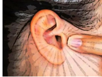
Scientists: Brain Scan Uncovers the Real Root Cause of Tinnitus (Ear Ringing) Healthier Living