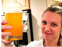
This Simple After-dinner Ritual Might Help You Get Rid of Stubborn Body Fat! Healthy Lifestyle