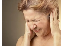
Brain Scan Uncovers Real Cause of Tinnitus (It's Genius) Healthy Lifestyle